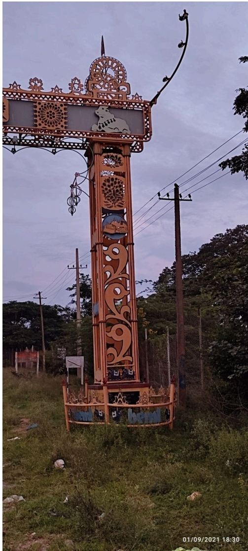
3. View of Right supporting Column on Bangarpet-KGF Road :